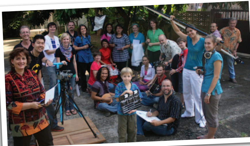
Our growing team in Thailand.